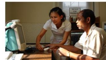
At Khmer Health Advocates a CHW provides telemedicine services

Visit https://nachw.org/covid-19-resources/ for more COVID19 resources for CHWs